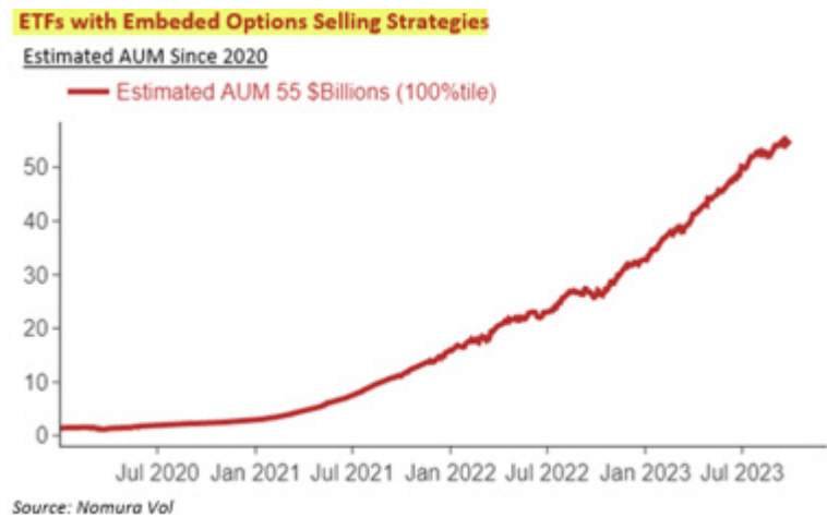
Chart 2: Growth in Volatility Selling Strategies

Globally, risk assets and longer duration bonds could not withstand the barrage of central bank hawkishness that accumulated over the week. Yield curves steepened while equities were sold aggressively at the same time. Though we have seen false dawns of possible extended bearish moves earlier this year, we highlight the fact that going into Q4, markets will have to deal with not only the ongoing monetary policy uncertainty but also the potential effects of another US Government standoff, the recommencement of US student loan repayments and elevated energy prices. Additionally, liquidity is increasingly at a premium in most markets. A dominant theme in the equity space this year has been short-dated volatility selling (termed “Vol Control” by practitioners). The growth in this market has been exponential, as shown in Chart 2 below. These strategies seek to constrain outsized intraday price moves and have been particularly successful through 2023 in a market where the underlying market trend has been positive. However, last Thursday’s +15% move in the VIX index was a reminder of the fragilities in these strategies in the event of a sustained move higher in volatility.